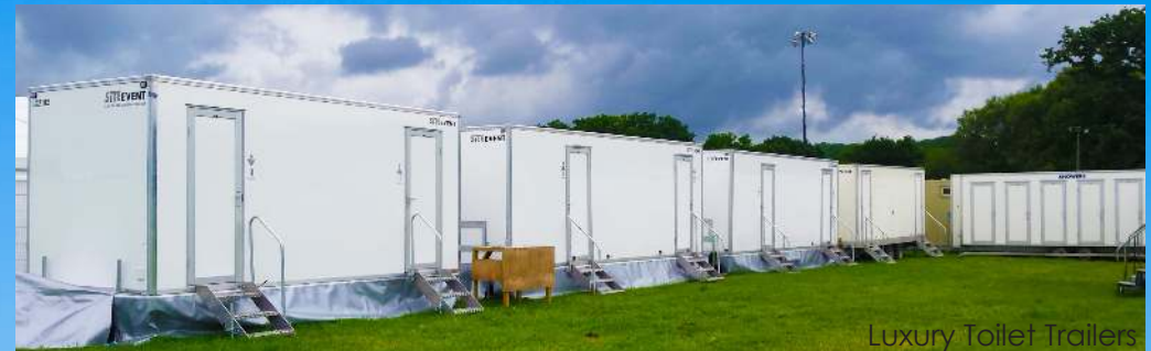
Luxury Toilet Trailers