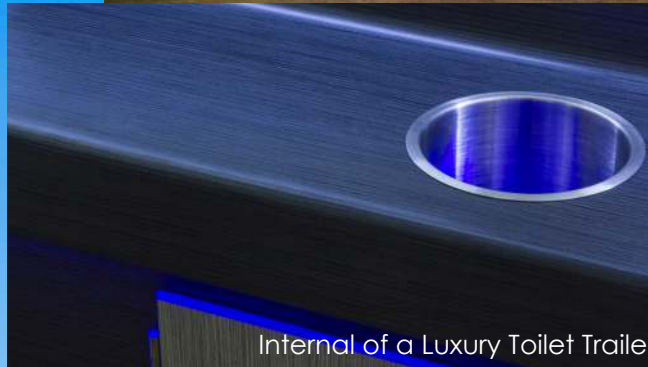
Internal of a Luxury Toilet Trailer

Glossy white luxury interior furnishings, with contemporary styling and comprises the latest toilet technology.