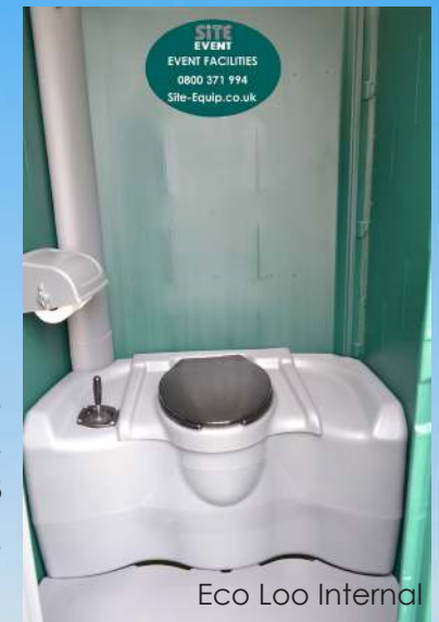
Eco Loo Internal

Translucent roof. British racing green exterior. Suitable for 75 persons over 8 hours.