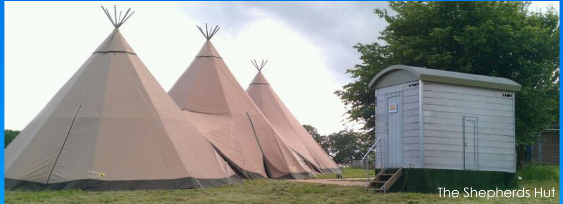
The Shepherds Hut

Unique to Site Event our range of luxury themed toilet trailers are fitted with bespoke interiors, co-ordinating accessories, vinyl wrapped exterior and a hand-made roof. Our themed toilet trailers never fail to impress, ensuring the loos are the talking point of your event! Built by our sister company for ultimate reliability and style.