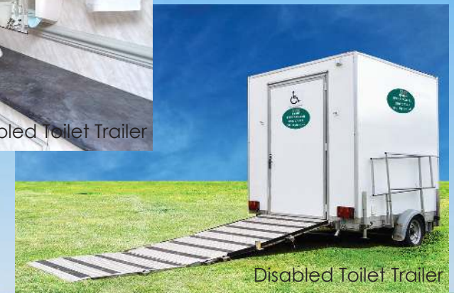
Disabled Toilet Trailer

White exterior, with a contemporary interior.