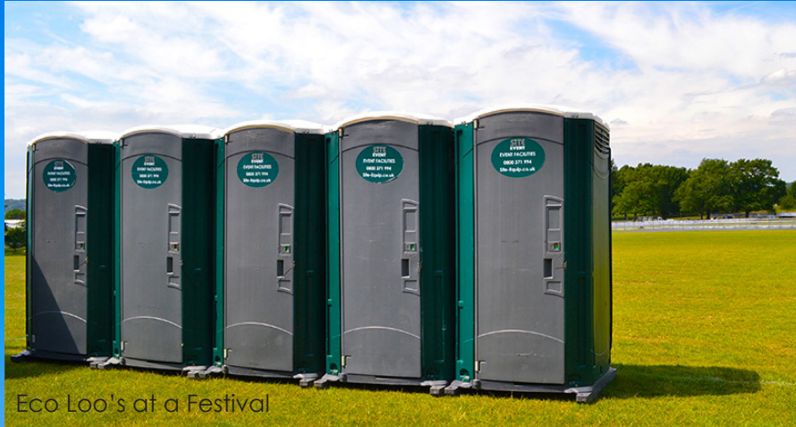
Eco Loo's at a Festival

Available with sink and hand towels (EFH) or hand sanitiser (ECO), all supplied with loo rolls.