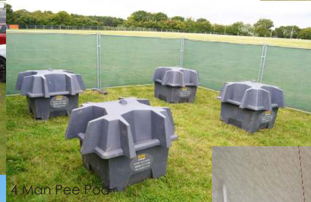
4 Man Pee Pod

Racing green gents modesty screens are available as an optional extra, recommended for when hiring 4 man and 6 man urinals.