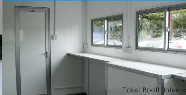
Ticket Booth Internal

Our mobile ticket booths encompass three slide across windows, electricity points, lights, heaters and a high table top. All units are built in house by Site Build. All mobile ticket booths can be provided with furniture.