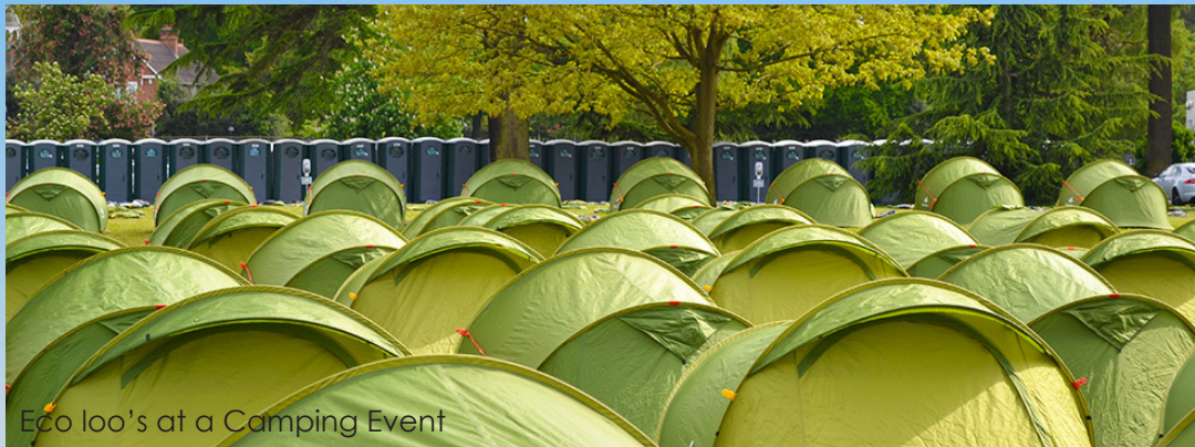
Eco loo's at a Camping Event

Out of hours team, available 24/7. 4ft x 4ft x 8ft. Mobile battery or mains lights available on request. Single disabled and multiple sized urinals also available.