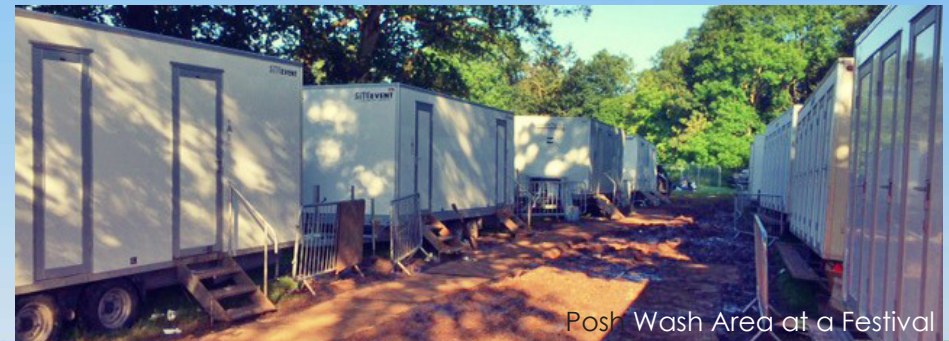
Posh Wash Area at a Festival