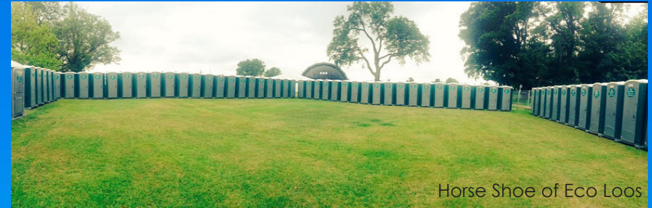
Horse Shoe of Eco Loos