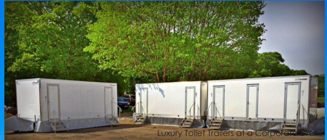
Luxury Toilet Trailers at a Corporate Event