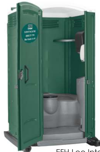
EFH Loo Internal

No mains power or water is needed for these self-contained units, perfect for large scale events, for easy access.