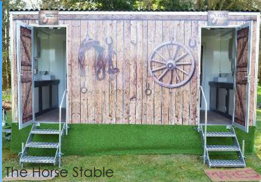
The Horse Stable

Requires an electricity supply and a water supply is recommended.