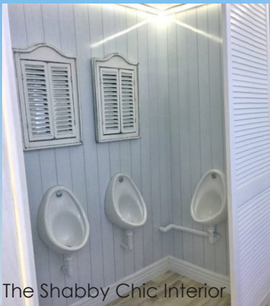
The Shabby Chic Interior

The Shabby Chic (3 female + 1 male + 3 urinals).