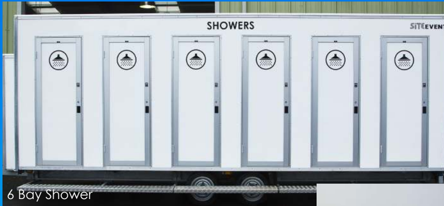
6 Bay Shower

Available in 4 bay cubicles and 6 bay cubicles, our mobile shower trailers offer a home away from home hot shower experience. The private wet rooms contain, a bench, mirror, hooks, non-slip flooring and full length slide away steps. Perfect for a weekend glamping or festival.