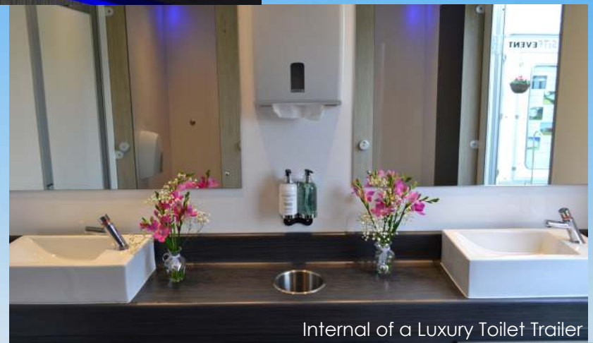
Internal of a Luxury Toilet Trailer