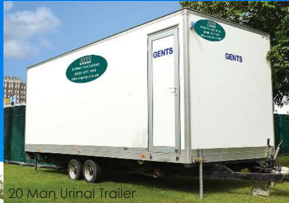
20 Man Urinal Trailer