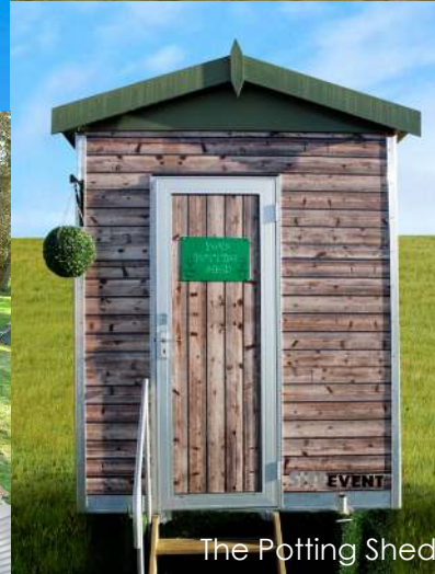
The Potting Shed

Our range of luxury themed toilet trailers are available in the following styles and sizes;