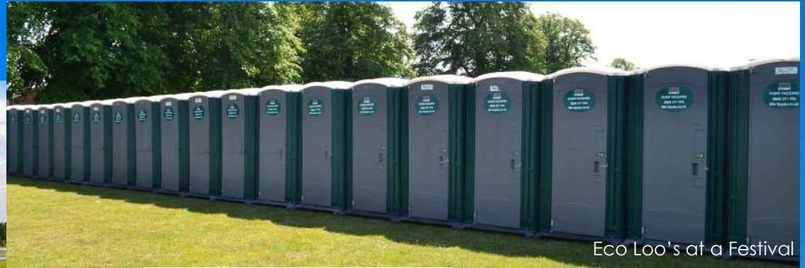
Eco Loo's at a Festival