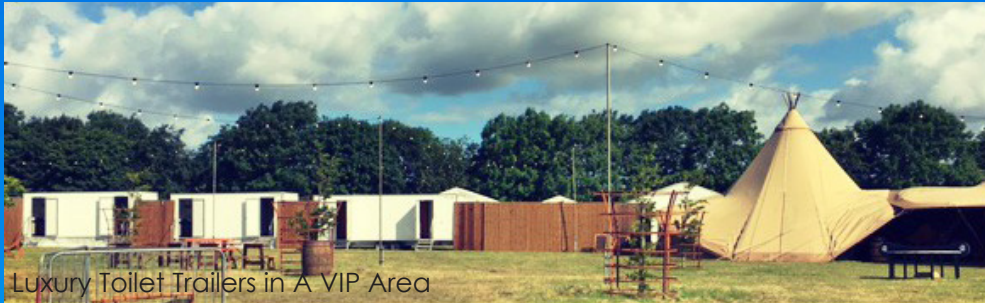
Luxury Toilet Trailers in A VIP Area

About Us Event Toilets Toilet Trailers Showers Accommodation Additional Services