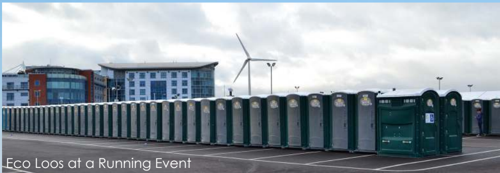
Eco Loos at a Running Event