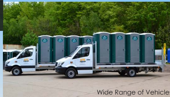
Wide Range of Vehicles