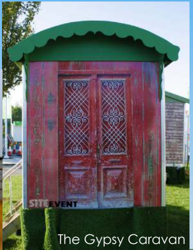
The Gypsy Caravan