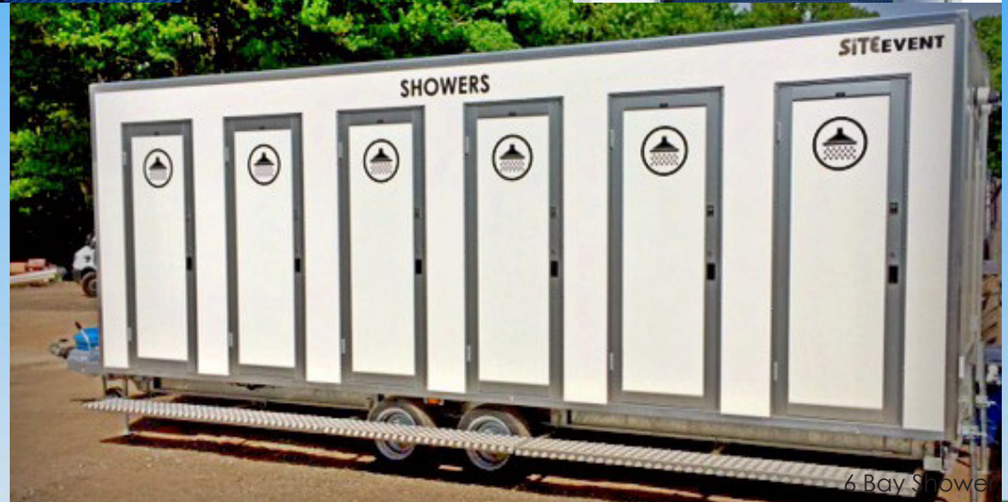
6 Bay Shower