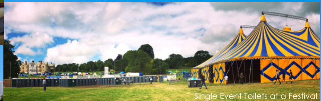
Single Event Toilets at a Festival

2000 Brought Site Equip's first website with constant improvement and facing new challenges in a fast changing world.