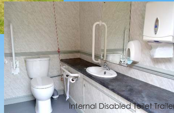
Internal Disabled Toilet Trailer

White exterior, with a contemporary interior.