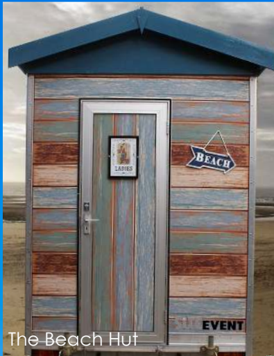
The Beach Hut

Unique to Site Event our range of luxury themed toilet trailers are fitted with bespoke interiors, co-ordinating accessories, vinyl wrapped exterior and a hand-made roof. Our themed toilet trailers never fail to impress, ensuring the loos are the talking point of your event! Built by our sister company for ultimate reliability and style.