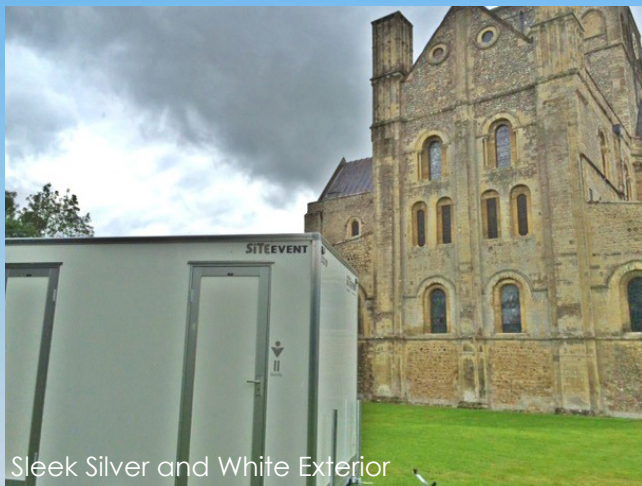
Sleek Silver and White Exterior

All of our units are built by our sister company, to ensure highest quality fixtures, fittings, and ultimate reliability. Our fleet is the youngest and most luxurious available on the market.