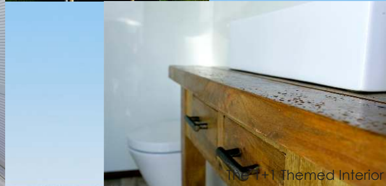
The 1+1 Themed Interior