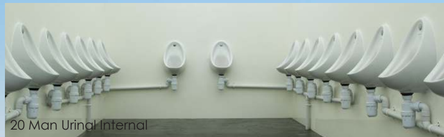
20 Man Urinal Internal

All units are supplied with hand sanitiser.