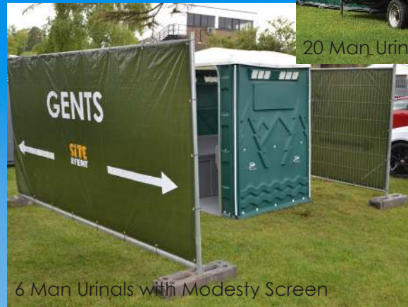
6 Man Urinals with Modesty Screen