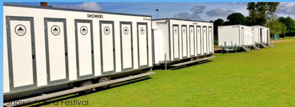
Showers at a Festival

We have the youngest fleet in the UK with our toilet trailers being manufactured in-house