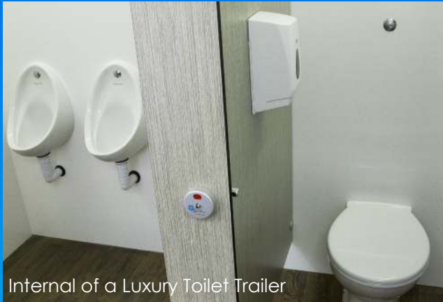
Internal of a Luxury Toilet Trailer